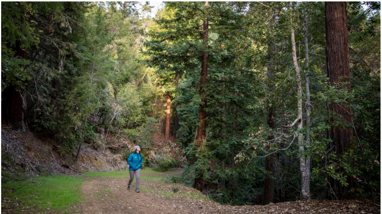
Save the Redwoods League has purchased and protected 453-acre Atkins Place in Mendocino County.

Nonprofit seeks to raise an additional $1 million at annual Take Me to the Trees fundraising event to fund new trails, bridge and other visitor amenities at Montgomery Woods State Natural Reserve.