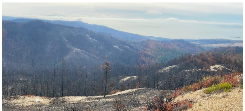
Views of Cascade Creek before the CZU Lightning Complex fires (top) and after the fires (bottom).