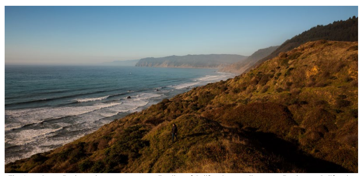
The Lost Coast Redwoods property spans 5 miles of California coastline near Rockport, California.

Potential for future public access along the famed Lost Coast