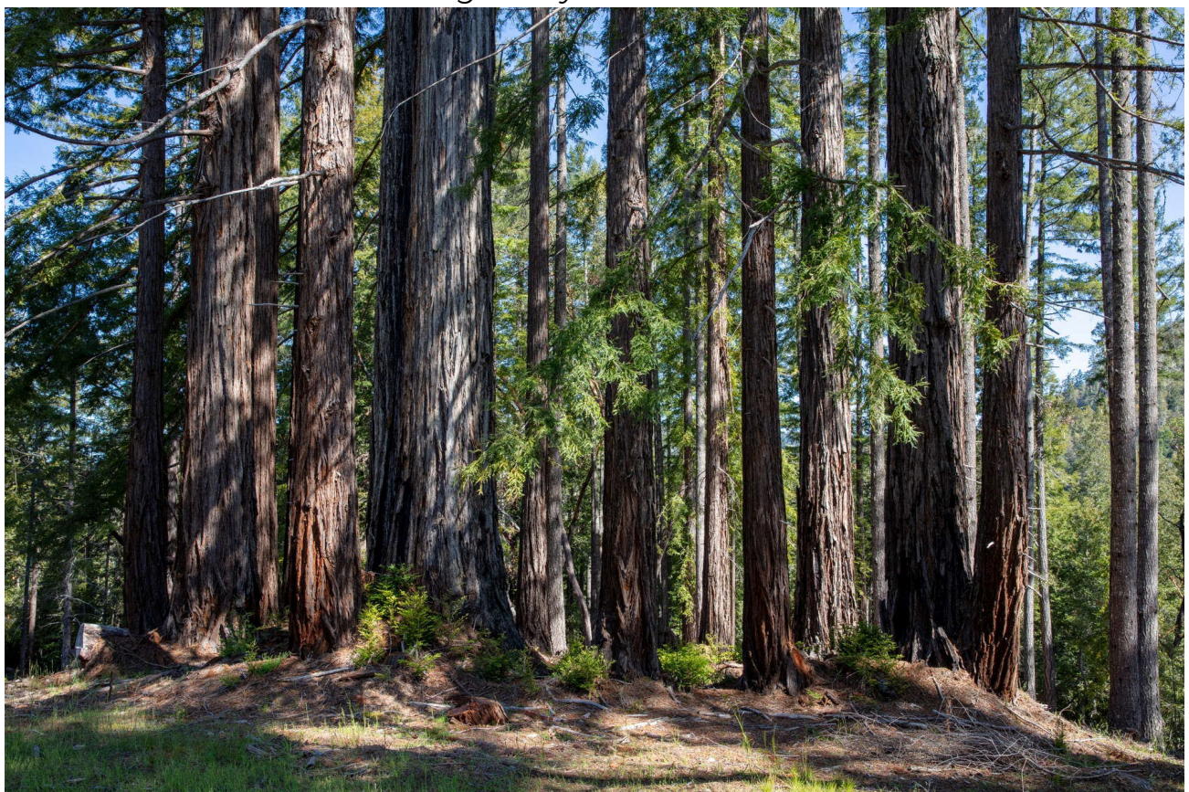
Save the Redwoods League has secured an opportunity to purchase a conservation easement on the 3,862-acre Weger Ranch.

Nonprofit seeks to raise $1 million to finalize deal that includes an 80-acre direct transfer to Montgomery Woods State Natural Reserve.