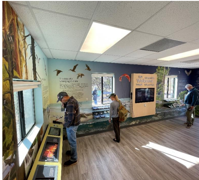
Top: California State Parks, Save the Redwoods League, and Waddell Creek Association invite the public to the new Rancho del Oso Welcome Center. Photo by Save the Redwoods League. Bottom left: The Rancho del Oso area at Big Basin Redwoods State Park. Bottom right: The Rancho del Oso Welcome Center features interactive and virtual interpretive exhibits, murals of the local coastal ecosystem and ocean views. Photo by Save the Redwoods League.