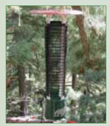
Fog interception collector

This is essentially what Dawson is developing today. Using new stable isotope methods along with innovative molecular and physiological techniques, Dawson's research group is building a working model of the redwood's basic biological functions—including how