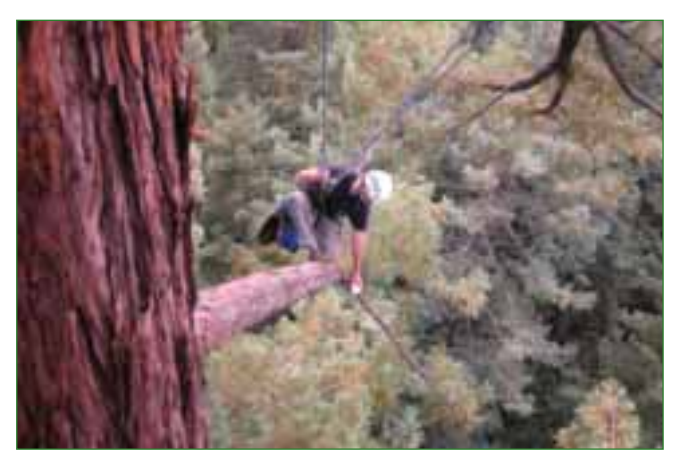
Anthony Ambrose, research team member, placing wireless sensor node in Sonoma County redwood

Trom the highest point atop a lofty peak in Germany near the turn of the nineteenth century, there exists a detailed account of an immense, magnificent figure created in the mists. Enveloped in shimmering sunlight, it hovered phantomlike, but for a moment, over its chronicling climber. The figure was in fact nothing more than the momentarily lingering shadow of the climber, assuming a deceptive grandeur in the sun. The