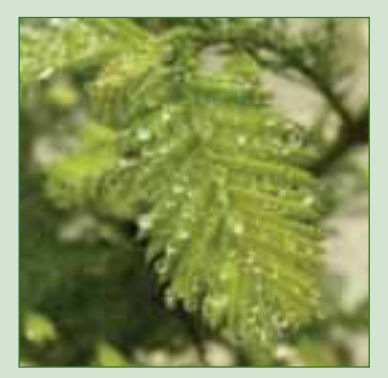
Fog condensation

gauge yearly growth and, comparing this to climate data, reveal connections between, say, fog