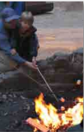
Interpretive programs at the campfire center

The 33-mile Skyline to the Sea Trail runs from Castle Rock State Park through Big Basin to Waddell Beach at Rancho Del Oso. During the winter, seasonal bridges on the Skyline to the Sea Trail are removed when Waddell Creek is high.