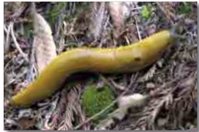
The fragile ecosystem supports a variety of life. Top to bottom: false turkey tail fungus, wild azalea, banana slug.

The emphasis is preservation of the forest’s entire ecology, with its significant geologic features, wildlife corridors and massive watershed.