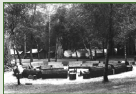
Campfire benches and tents, ca. 1915