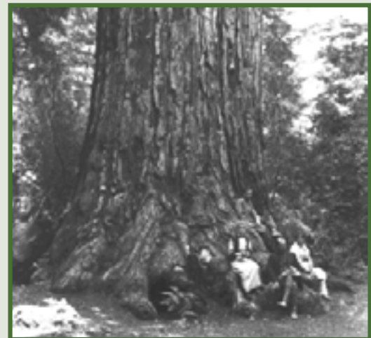
Father of the Forest redwood, ca. 1915

Hill photographed much of the early history of Big Basin: