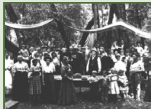
Sempervirens Club annual meeting, ca. 1915