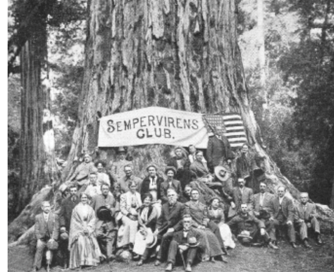
Sempervirens Club with the famous Father of the Forest tree, 1901

name Sequoia may honor Sequoyah, the 19th-century inventor of the Cherokee alphabet, and sempervirens means "ever living." These trees are part of a once-huge ancient forest of which less than five percent remains. The redwood is California's official state tree.