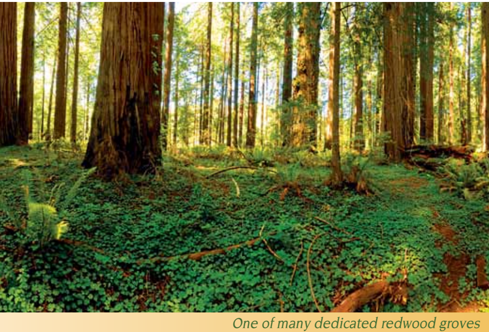
One of many dedicated redwood groves