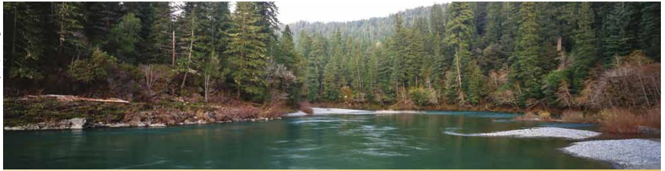
The scenic Smith River

Nevada to the Pacific coast. In 1821, at age 22, he came west and joined the fur-trapping party of General William Ashley. By late 1826, Smith and two partners had bought out General Ashley. Smith led his trappers across southern Utah, Nevada, Arizona, the Mojave Desert and Cajon Pass to Mission San Gabriel, where they rested for two months.