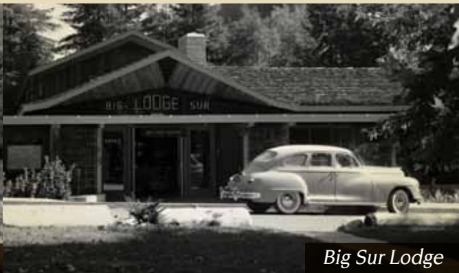
Big Sur Lodge