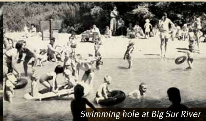
Swimming hole at Big Sur River