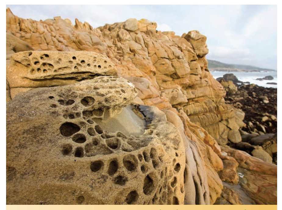
Tafoni formations in sandstone

Popular activities at the park include camping, picnicking, fishing, free diving, kayaking, scuba diving and hiking.