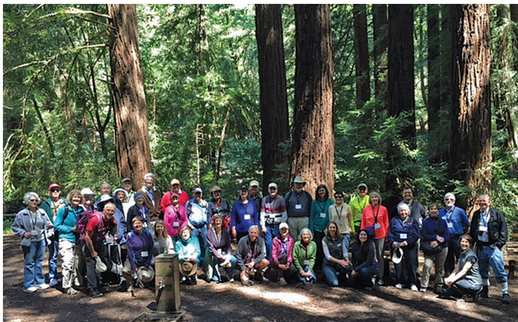
Legacy Circle members on an April hike in the redwood forest to learn more about the League's work.