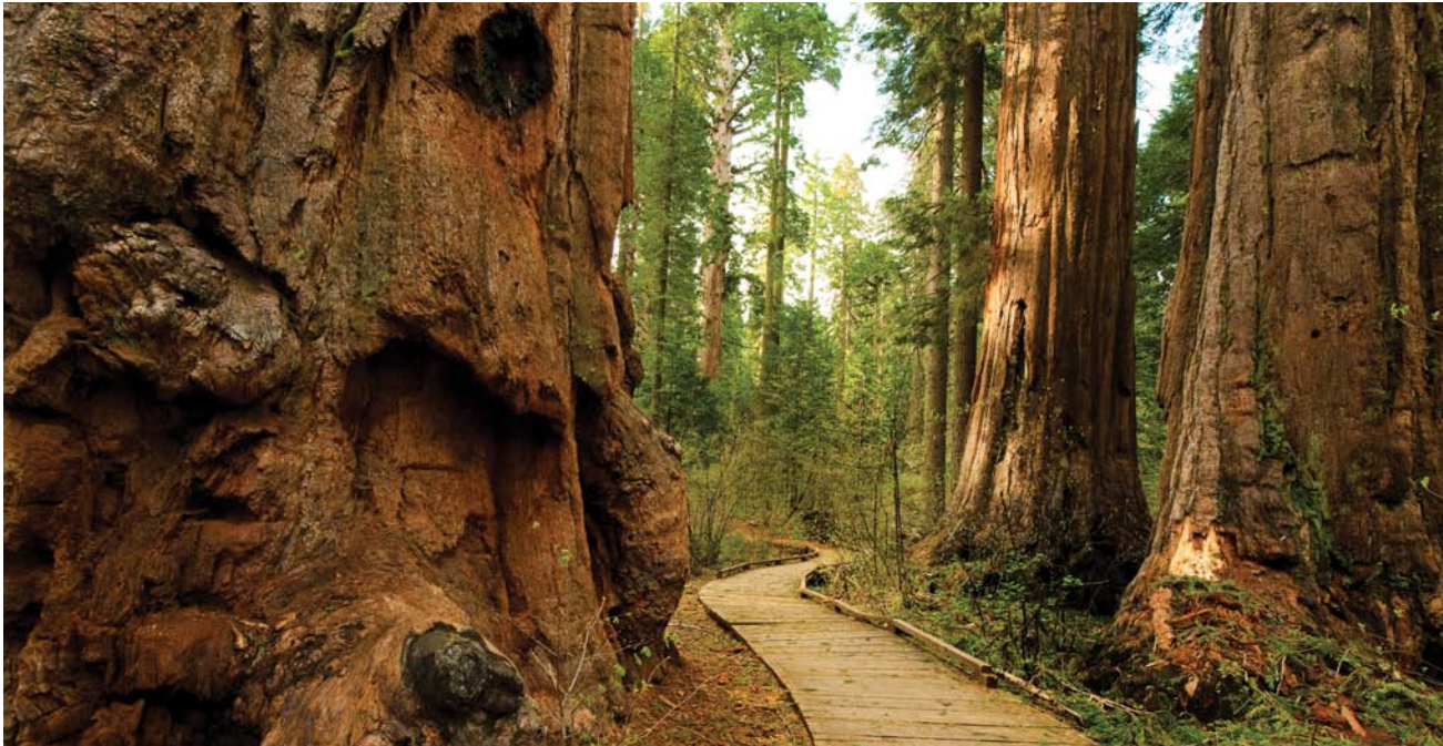
Giant sequoia trees on the North Grove Trail

Trails —The North Grove has a level, 1.5-mile self-guided trail. The .13-mile Three Senses Trail allows visitors to experience the feel, smell and sounds of this magnificent forest. The five-mile South Grove Trail travels along Big Trees Creek and passes the park’s