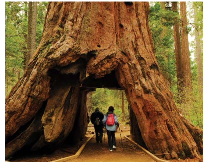
Pioneer Cabin Tree