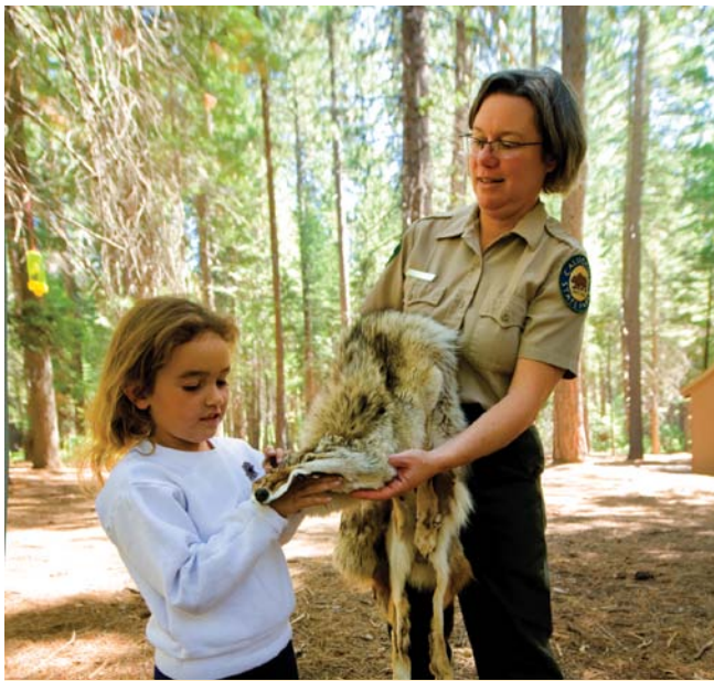
A park Junior Ranger learns about wildlife by handling a coyote skin.

two largest trees—the Agassiz Tree and the Palace Hotel Tree. The fairly strenuous four-mile River Canyon Trail runs between the North Grove and the Stanislaus River. Along the Lava Bluffs Trail, hikers can enjoy the scenic North Fork of the Stanislaus River.