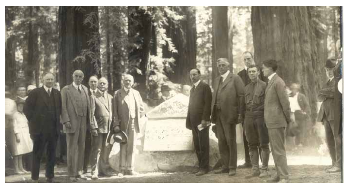
The Bolling Grove was dedicated 90 years ago in what is now known as Humboldt Redwoods State Park. Groves are still available in this park.

To learn more about the Grove Program, contact Megan Ferreira at mferreira@SaveTheRedwoods.org, (415) 820-5809, or return the enclosed envelope.