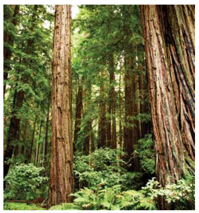
Groves like this one in Butano State Park are available for dedication.

To make the dream of dedicating a redwood grove a reality, many League supporters choose to make their grove gifts over three years.