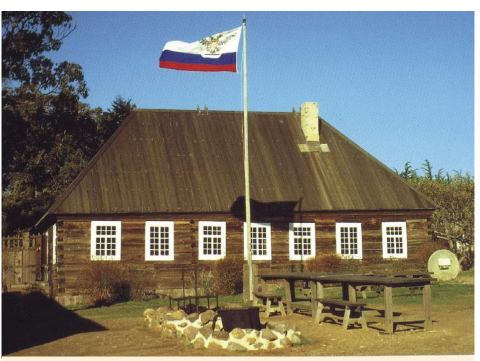
Russian flag over the Rotchev House

the first Russian Orthodox chapel south of Alaska, the stockade, and five other buildings—the first manager's home (Kuskov House), the Officials' Barracks, a Fur Warehouse (or magazin ) and two blockhouses.