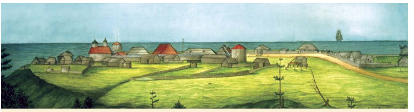
Settlement Ross, 1841 by I.G. Voznesenskii

Interpretive presentations and educational programs are offered. Cultural Heritage Day is held annually in July. School groups may participate in "living history" Environmental Living Programs, taking participants back to the early 1800s. For more information, please call (707) 847-4777 or visit the website at www.fortrossstatepark.org .