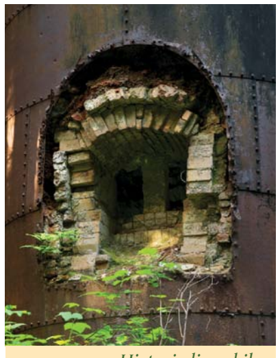
Historic lime kiln

Falls Trail—Hike along Limekiln Creek to the beautiful 100-foot waterfall. The vision of this fan-shaped fall is worth getting your feet wet when crossing the creek.