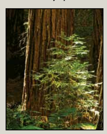
Several years after the fire

have endured through fire—an important part of the natural forest ecosystem. Periodic forest fires also clear mounded duff and tree debris. The