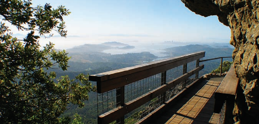
Spectacular views of the San Francisco Bay area can be seen from the Verna Dunshee Trail near East Peak.

Mountain Theater —The 3,750-seat Mountain Theater, officially the Cushing Memorial Amphitheatre, was built of natural stone in the 1930s by the Civilian Conservation Corps. The theater can be reserved for special events. Each spring since 1913, the Mountain Play Association theatrical company has presented outdoor productions of Broadway musicals. For dates and reservations of Mountain Theater performances, contact the Mountain Play Association at (415) 383-1100.