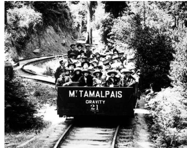
Gravity car on Mount Tam's Scenic Railway, ca. 1900