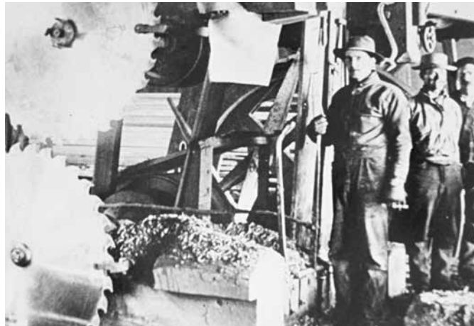
Van Damme sawmill

Van Damme habitats include marine, coastal beach, coastal bluff terrace, pygmy forest, redwood forest, and riparian, with