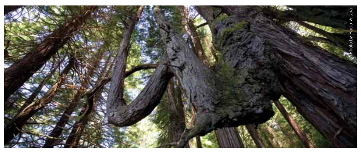
Our purchase of the Shady Dell property protects old redwoods shaped by coast winds and salty air, salmon streams and a mile of wild, remote Lost Coast beach. The property is at location 1 on the map on page 11.