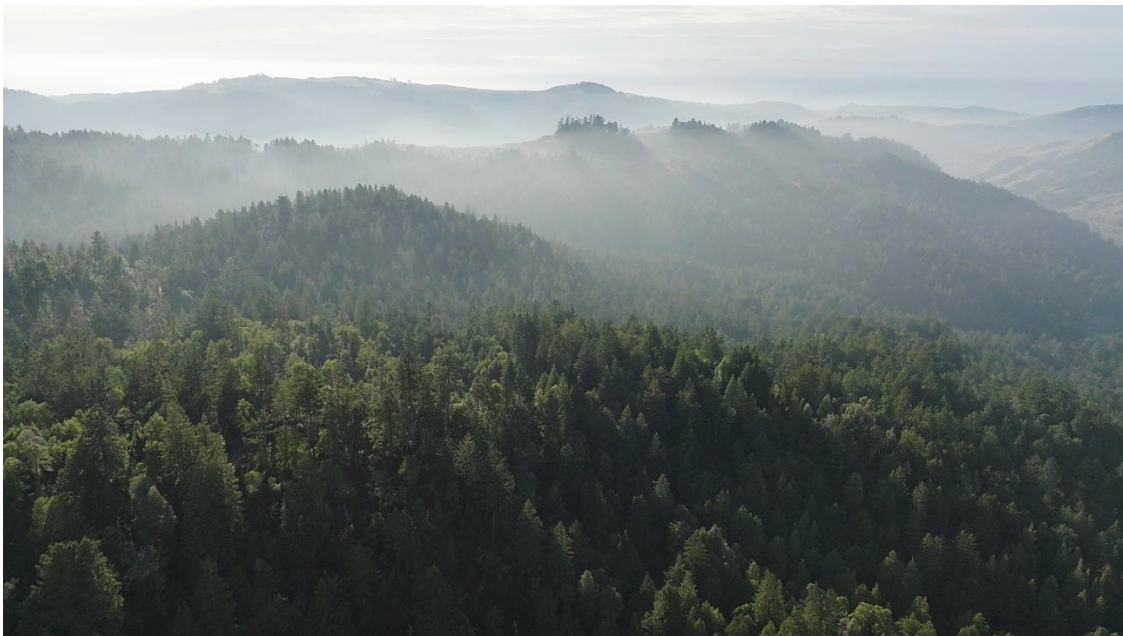
The 1,517-acre Monte Rio Redwoods Expansion property in Sonoma County.

Monte Rio Redwoods Expansion offers connectivity for habitat conservation and future expanded public access to Monte Rio Redwoods Regional Park and Open Space Preserve