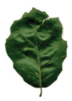
Coast Live Oak

Leaves are 7-15 cm long with poky edges with a thick, leatherly texture.